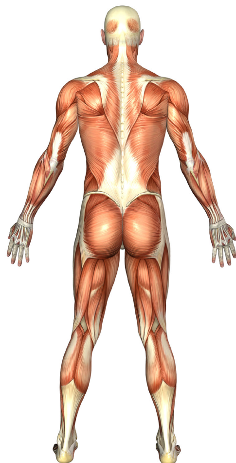
Rear of body